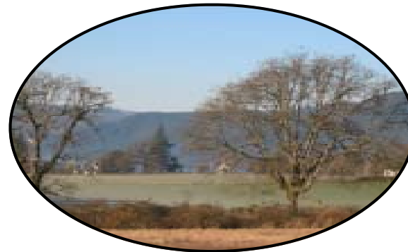
Mt. Newton Valley