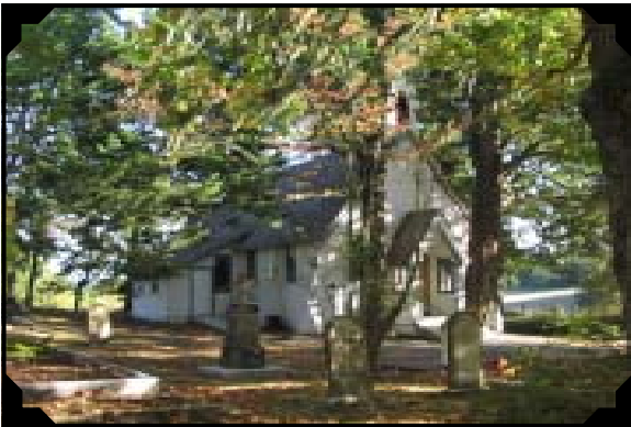
St. Stephen's Church