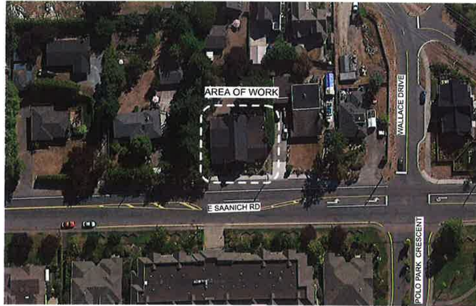
2 AERIAL VIEW Scale: Not to scale