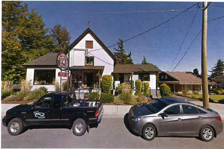
4 IMAGE - FRONT VIEW Scale: Not to scale