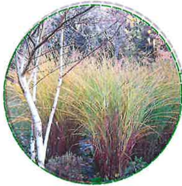
JAPANESE MAIDEN GRASS, AUTUMN COLOURING

General Provisions Landscape works shall be installed in accordance with the provisions of the latest edition of the Canadian Landscape Standard & Canadian Nursery Stock Standard Planted areas shall be provided with fully automated underground irrigation and suitable for tree watering, in accordance with the provisions of the Irrigation Industry Association of BC (IIABC).