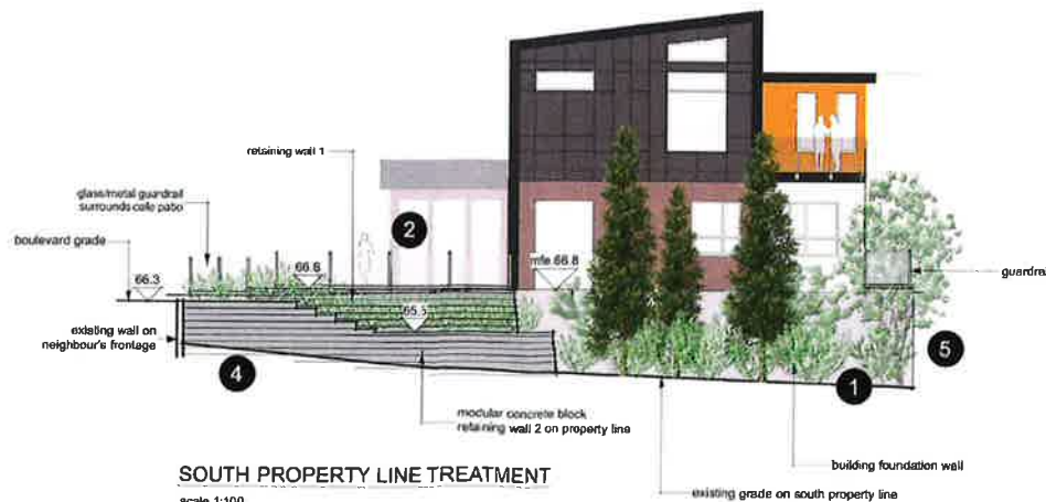
SOUTH PROPERTY LINE TREATMENT scale 1:100